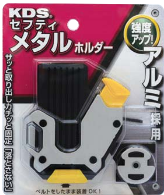
Pocket Tape Holder