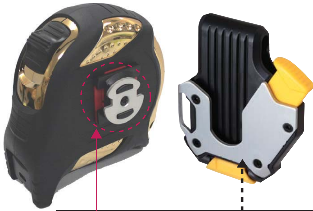
Alumino-Holder & Adapter